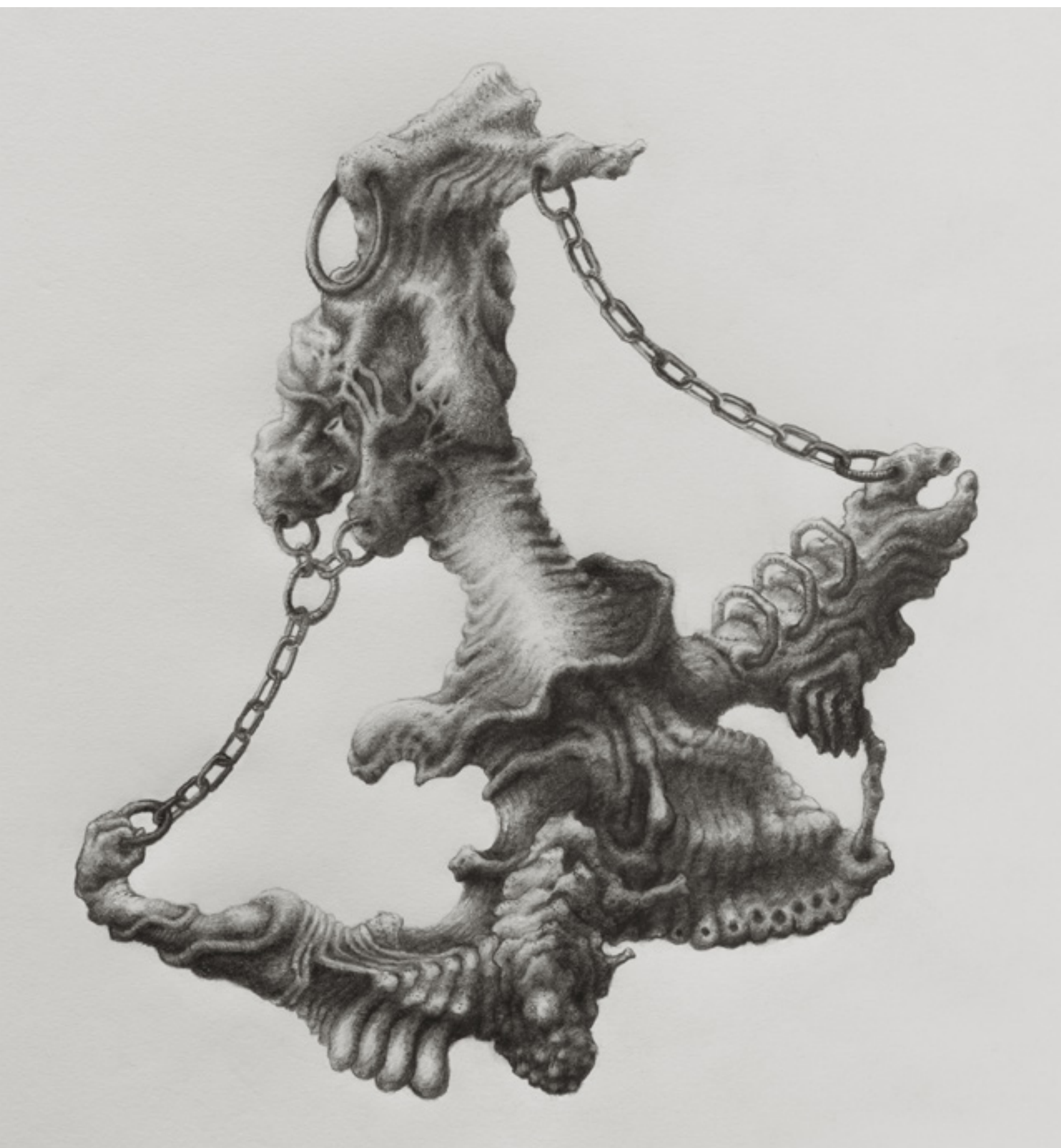
Anchor pencil 2023 20 x 20 cm