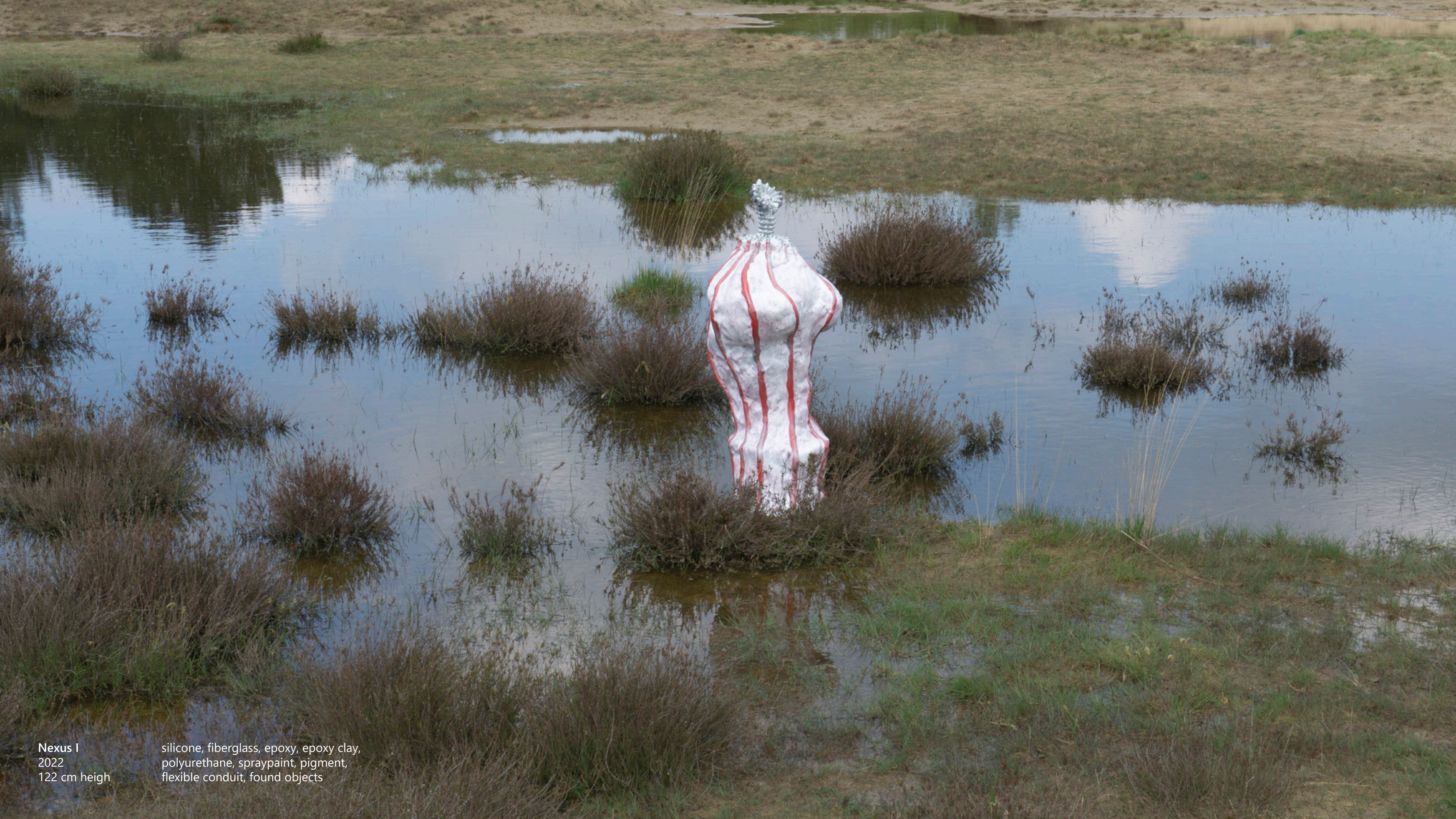
Nexus I 2022 122 cm high

silicone, fiberglass, epoxy, epoxy clay, polyurethane, spraypaint, pigment, flexible conduit, found objects