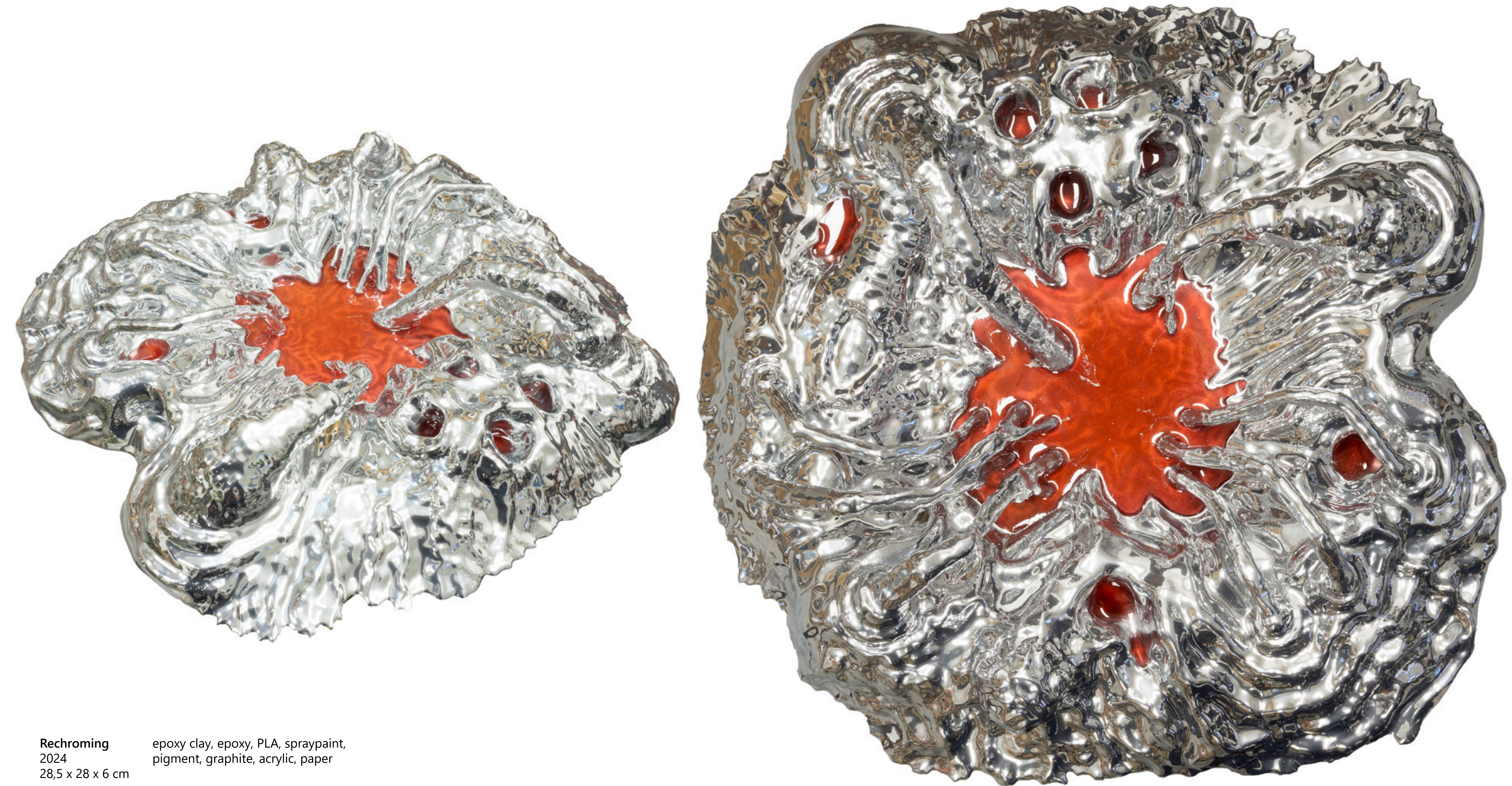
Rechroming 2024 28,5 x 28 x 6 cm epoxy clay, epoxy, PLA, spraypaint, pigment, graphite, acrylic, paper