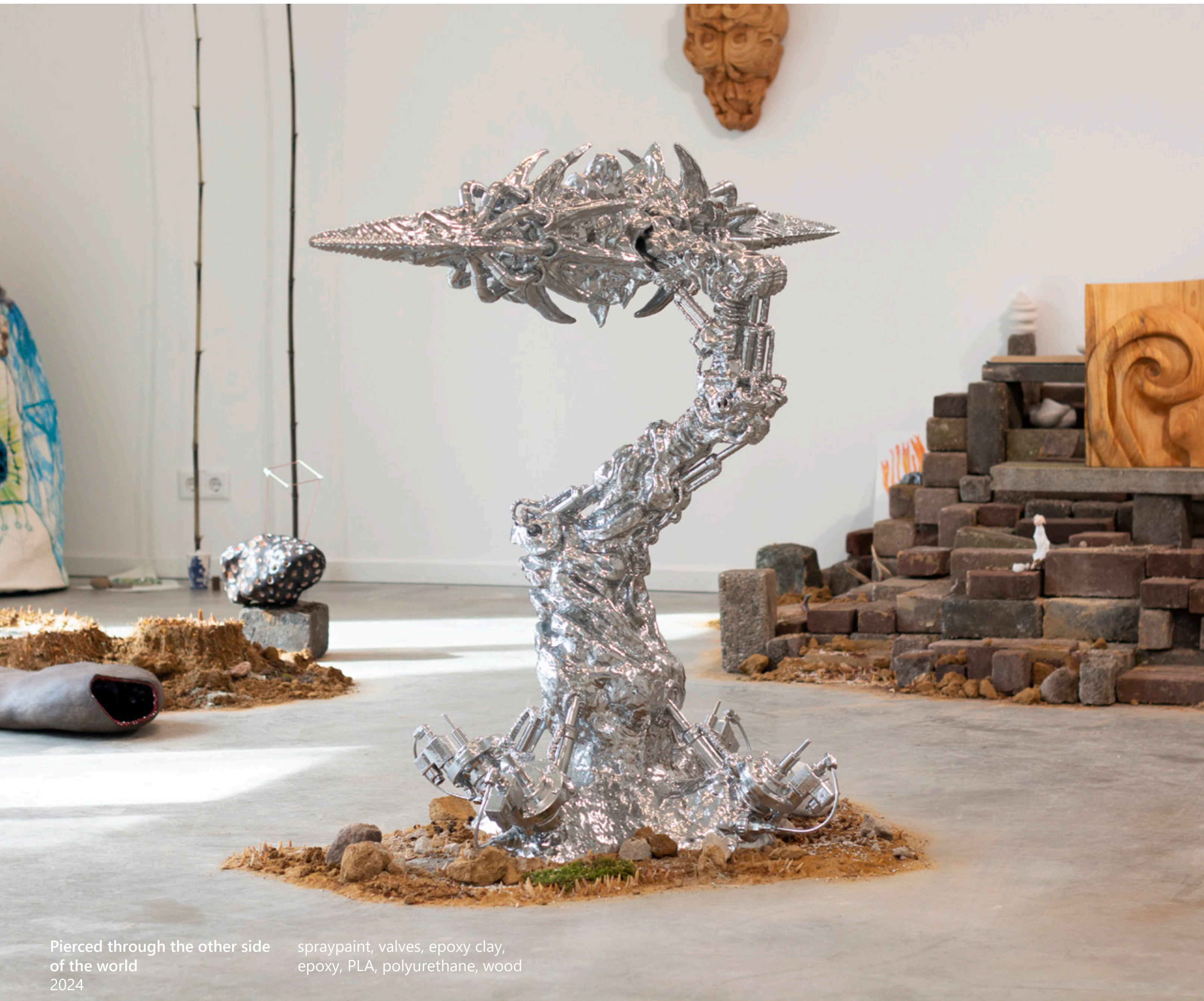
Pierced through the other side of the world 2024

spraypaint, valves, epoxy clay, epoxy, PLA, polyurethane, wood