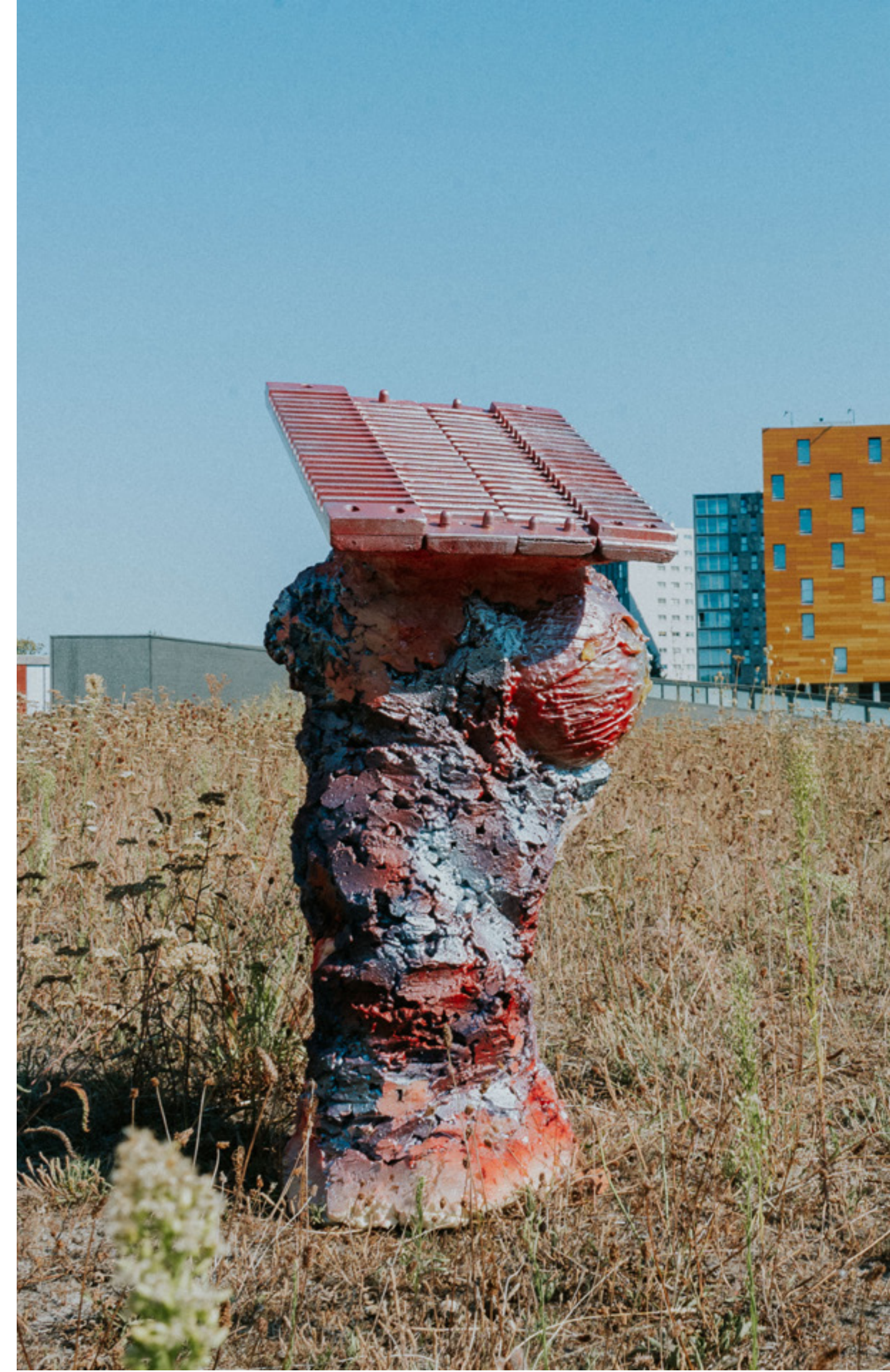
Nexus II, III, IV 2022 dimensions variable Made at the 4 week residency program 'BIJ/NA' at the StadsGallerij in Breda.