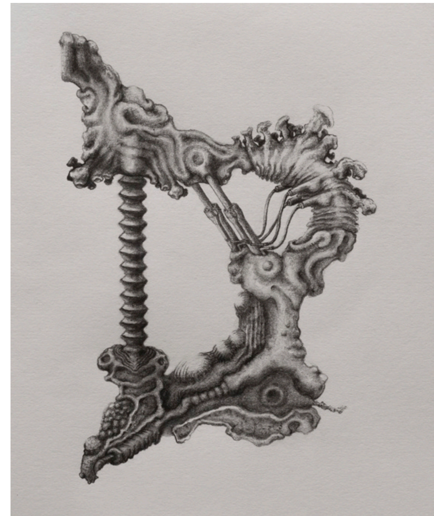
Aggressive Hydraulics pencil 2023 20 x 20 cm