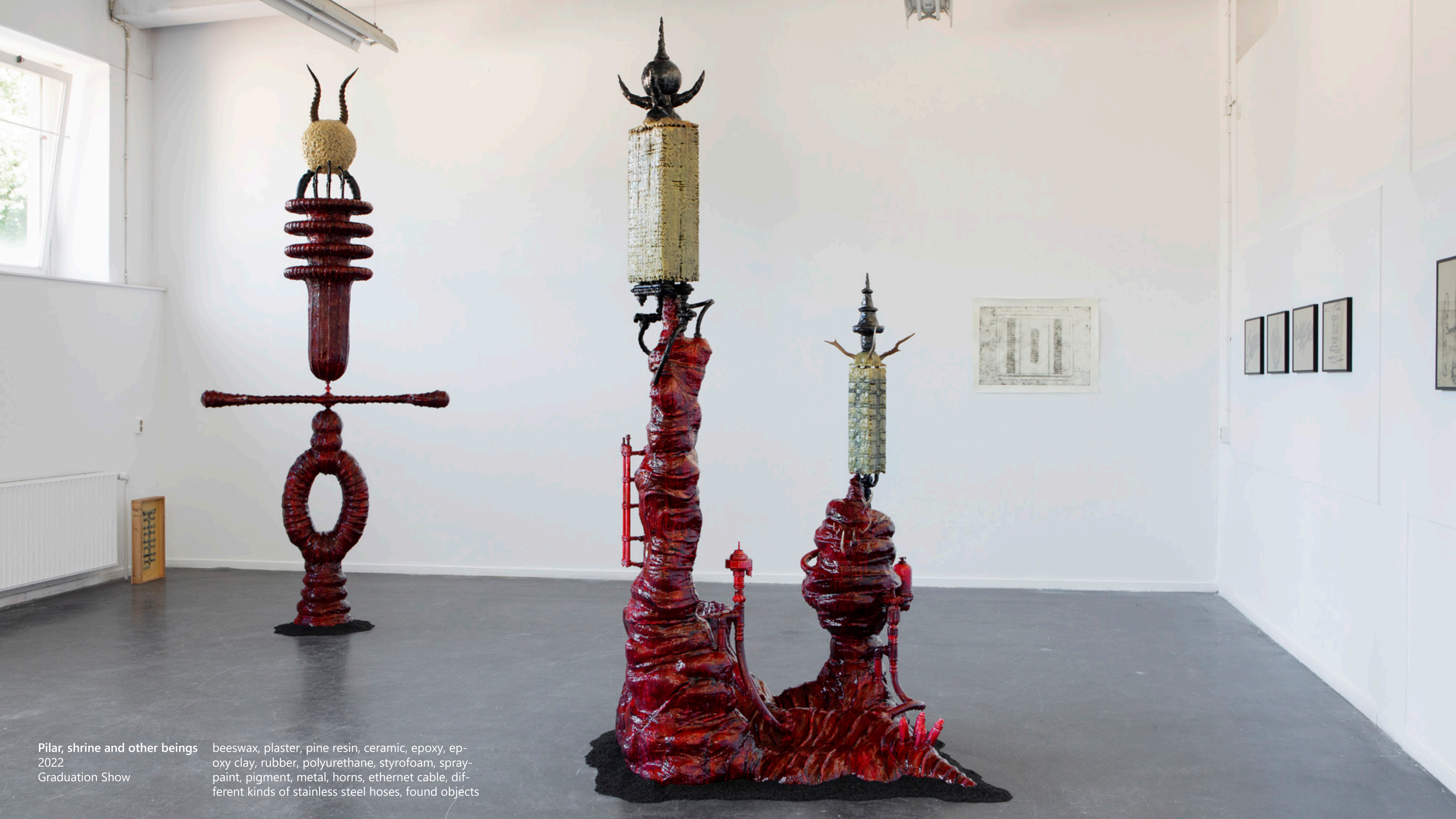
Pilar, shrine and other beings 2022 Graduation Show

beeswax, plaster, pine resin, ceramic, epoxy, epoxy clay, rubber, polyurethane, styrofoam, spray-paint, pigment, metal, horns, ethernet cable, different kinds of stainless steel hoses, found objects